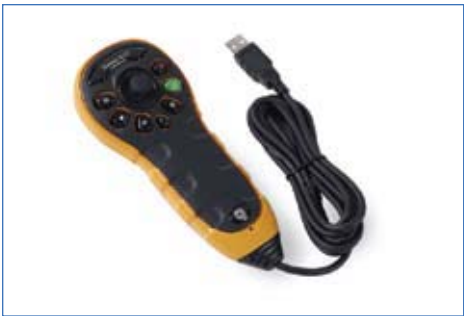
Wired remote control with joystick