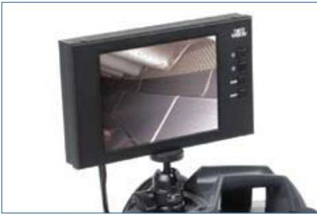
External SVGA LCD monitor