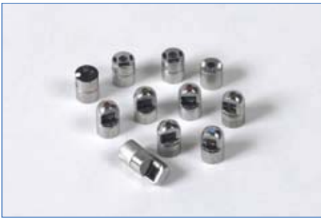
Full range of optical tips including stereo and shadow measurement with a NIST traceable verification block