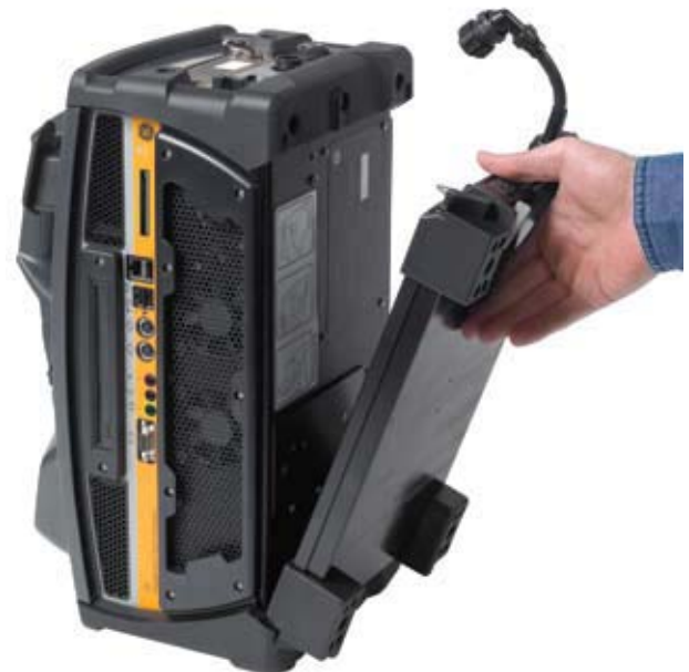
System with integrated battery