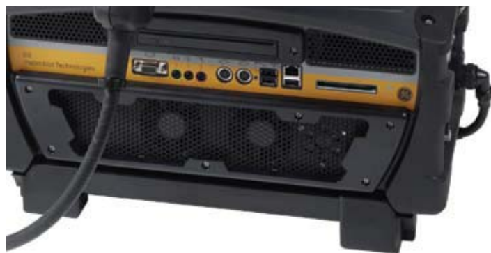
One- or two-hour capacity battery/UPS facilitates confined space work.