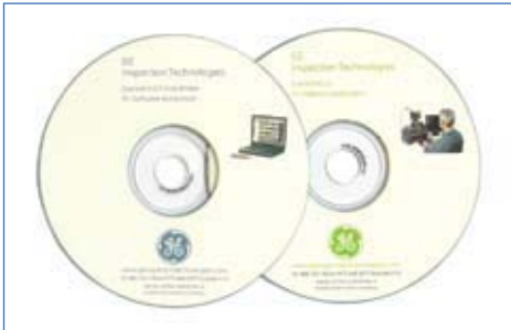
Application software (Menu Directed Inspections and Report Generators)