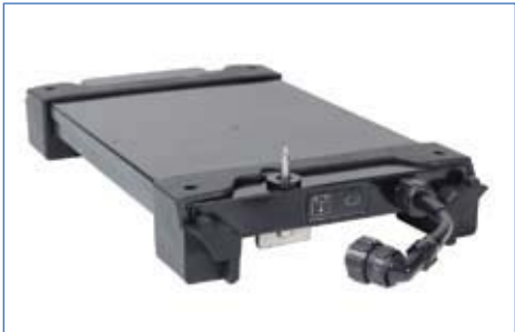
One- or two-hour capacity battery/UPS (uninterruptible power supply)