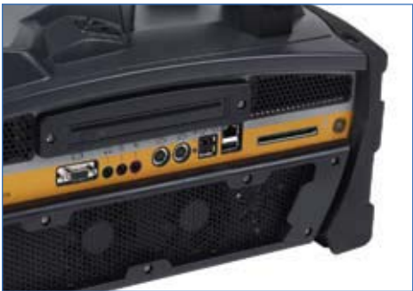
One CompactFlash® slot for expanded memory