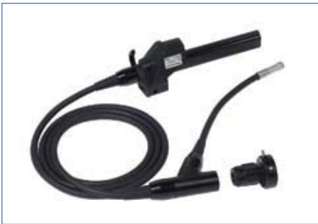
Borescope adapter for rigid and flexible bore- scopes and high- magnification lenses