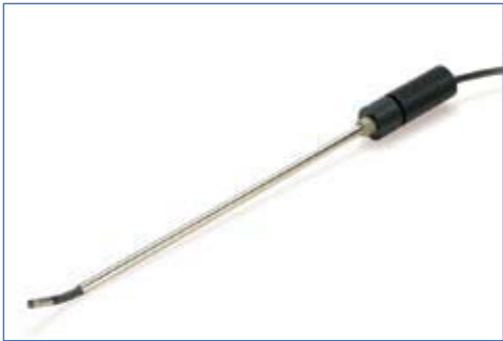
Rigidizers and Grippers