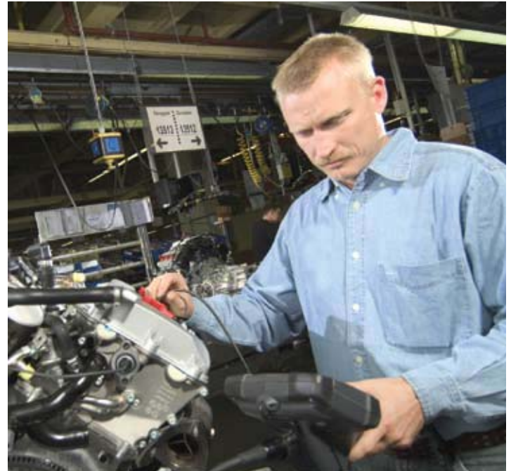
Inspect valve seating through the spark plug port