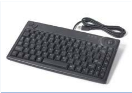
USB® keyboard with trackball