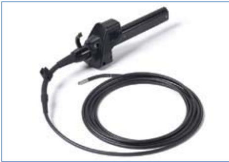
QuickChange™ spare probes in 3.9 mm, 5.0 mm, 6.1 mm, 6.2 mm with working channel* and 8.4 mm diameters in lengths of 2, 3, 4.5, 6, 8, and 9.6 meters